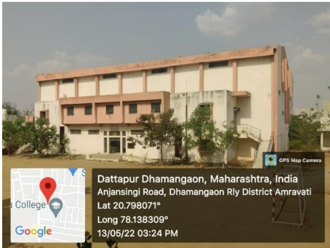
Indoor Stadium Facility