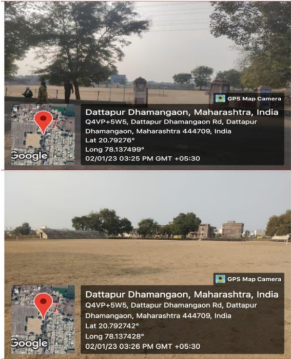
Mishrikotkar Ground Photos