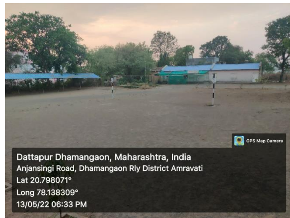
Holly Ball Ground