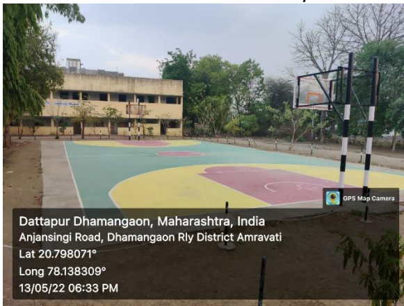
Basket Ball Ground