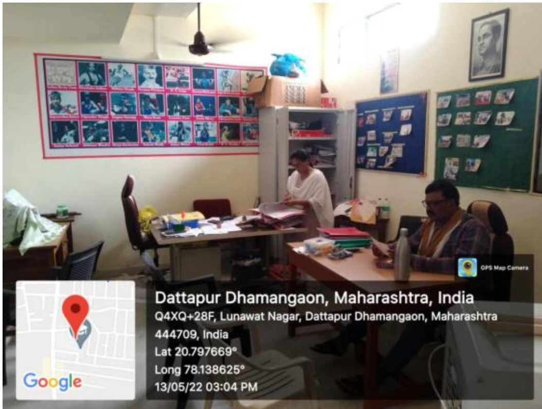
Department of Sports and Physical Education