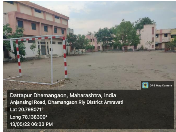
Hand Ball Ground